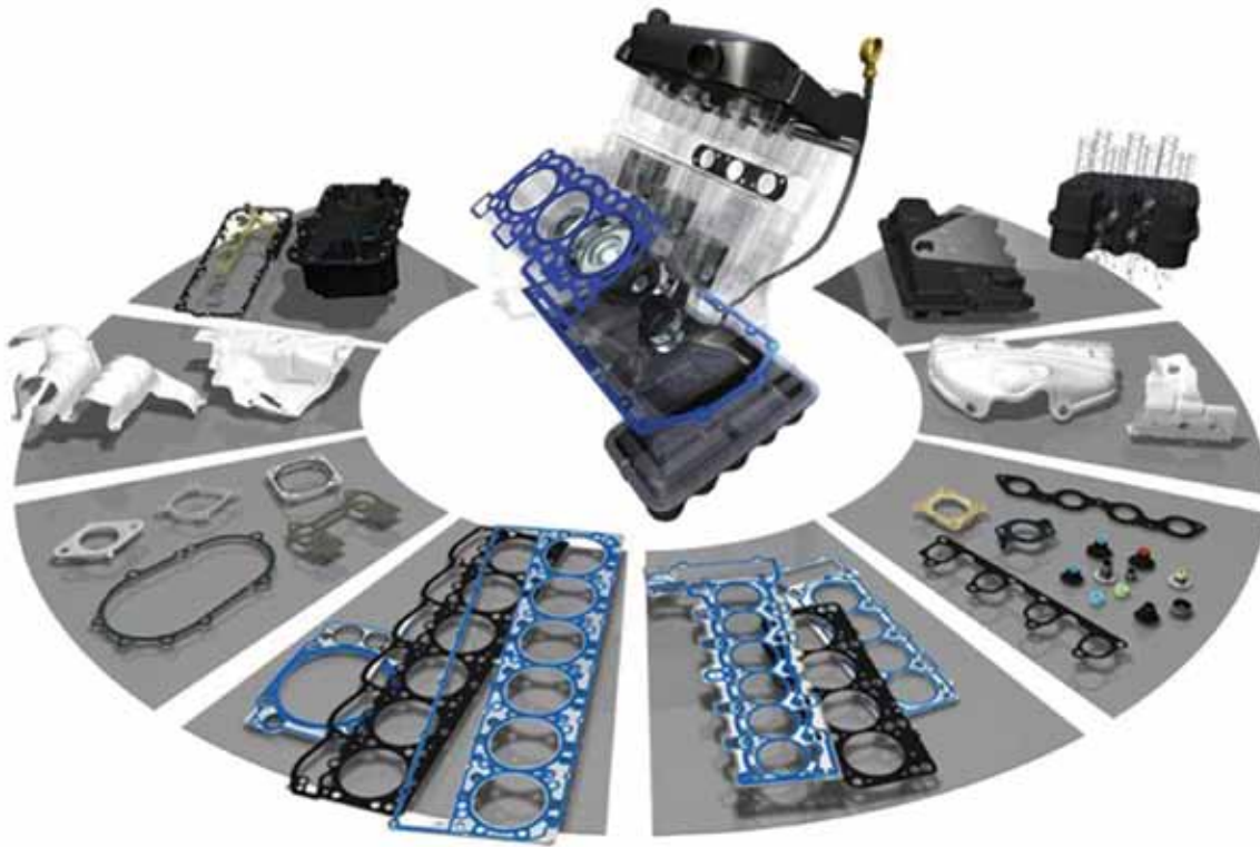
Figure 1. Sealing system components for powertrain, exhaust and aftertreatment applications

that must be taken into account during the simulation. Degrees of freedom are the set of independent displacements and/or rotations that specify completely the displaced or deformed position and orientation of the body or system (specifically of an element in a FEA model). Ten years ago, Popielas recalls, they were working with one or two million degrees of freedom. Today that number has reached five or six million, and in a few years they will be simulating models featuring significantly above 10 million degrees of freedom.