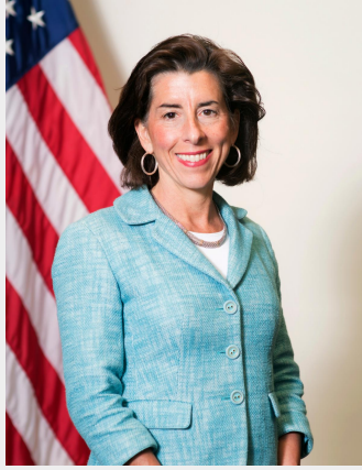
The Honorable Gina M. Raimondo Secretary, U.S. Department of Commerce