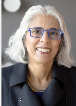
Dr. Arati Prabhakar Director, Office of Science and Technology Policy, and Assistant to the President for Science and Technology, the White House