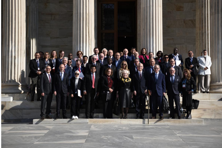
GFCC Members at the Academy of Athens, Greece, November 15, 2022