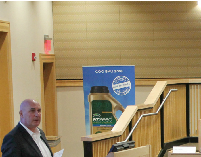
Hugh Grant, Chairman and Chief Executive Officer, Monsanto Company.

With regard to efficient delivery of water, there are significant opportunities not only around installation of pivots and irrigation systems, but also in the development of new materials that improve efficiency. A smart membrane that senses soil moisture levels and releases water only when needed, for example, would be much more beneficial than a pressurized system that can break, overwater or use excessive amounts of energy. These materials are not science fiction—they already exist, but come at relatively high costs versus traditional irrigation methods. 18