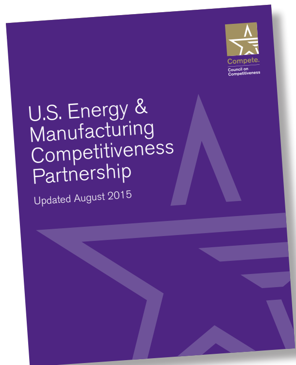
The Energy & Manufacturing Competitiveness Partnership Concept Paper, August 2015.