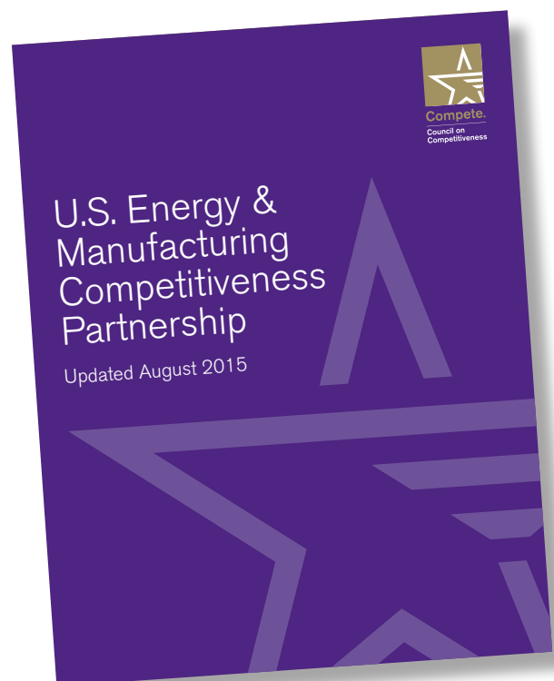
The Energy & Manufacturing Competitiveness Partnership Concept Paper, August 2015.