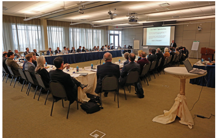
Participants at the Water and Manufacturing Sector Study Meeting at Marquette University Law School in Milwaukee, WI.

Far too often, little light is shed on the possibilities for water careers. There is an increasing effort to provide real, tactical solutions to this issue and increase the attractiveness of water careers for people of all ages from “k-through-gray.” This requires the union of industry and education under three key drivers of talent: existing technologies, macro changes and new policies. The talent pool needed to advance this space must be carefully crafted through specific training and education that can be achieved through public-private partnerships. In addition to increasing technical skills, it is crucial to consider interdisciplinary studies when thinking of the education opportunities needed to create a stronger talent pool.