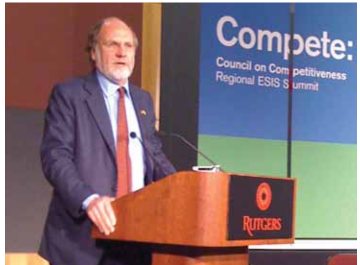
New Jersey Governor Jon Corzine.

He described solar farms cropping up throughout New Jersey, including ones installed by Merck & Co., Inc. and Rutgers, The State University of New Jersey. The state now generates 85 kilowatts of solar energy, up from 10 kilowatts when Corzine