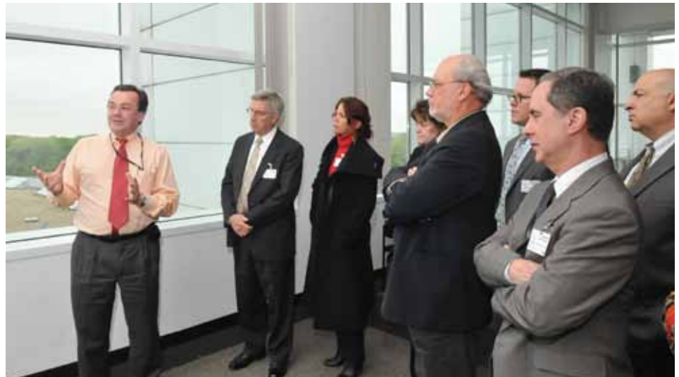
Summit participants tour Argonne National Laboratory and learn about its cutting-edge research.