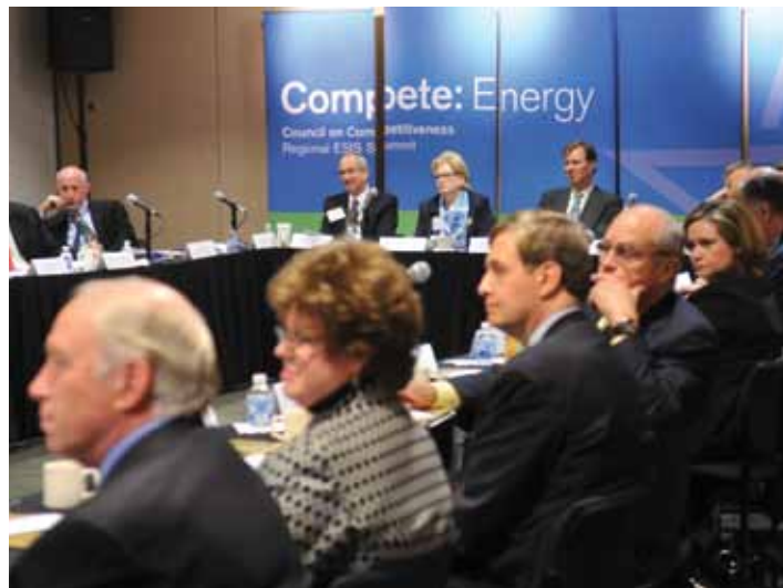
Midwest Energy Summit attendees participate in a roundtable discussion.

Rosemarie Andolino O’Hare Modernization Program