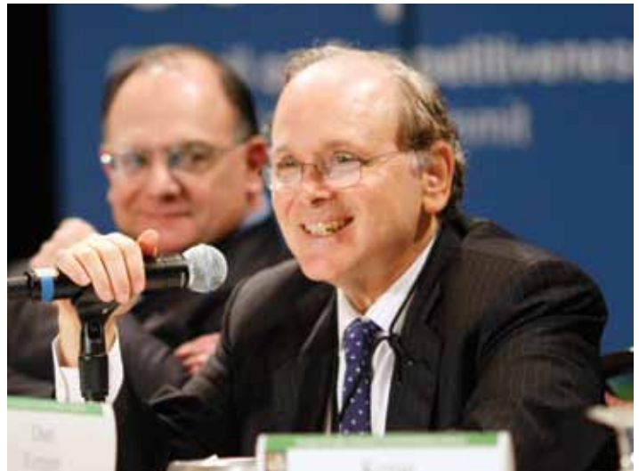
The Southern Energy Summit was held in conjunction with CERAWeek 2009. The Council was delighted that Daniel Yergin, chairman of CERA, was able to spend a few moments with participants at the conclusion of the Summit program. Yergin shared some off-the-record comments on highlights from CERA’s events.

Wince-Smith concluded the session by summarizing the discussion: all energy sources must be part of the national energy “portfolio,” and fossil fuels will be part of that portfolio for many years, but in a more sustainable form. It is critical to reduce energy market volatility. The nation must deal with the different time frameworks from the short to the long term and the scale and scope of the investments. And collaboration must occur between the public and private sector.