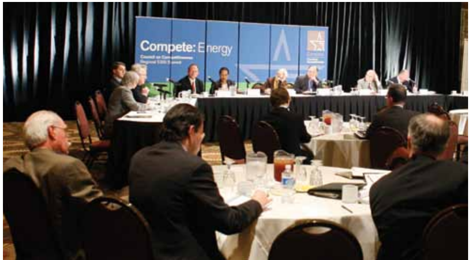
Experts from industry, academia, government and labor had several opportunities to pose questions to Summit participants.